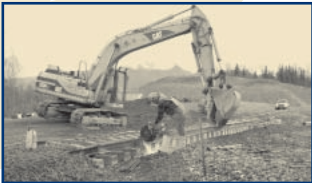
Crews tie the new track alignment into the mainline.

The lineover involved a crew of 22, who began work at the crack of dawn to replace four 200-foot sections of track. These were located where the two alignments tied together and where they intersected. ●