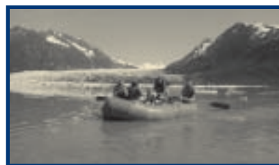
Passengers can choose to include a raft float tour from Spencer Glacier.

There's plenty to talk about along the route that first winds south along Turnagain Arm, tucks into Whittier, then turns away from the highway at Portage and travels deep into the Kenai Mountains. The trail rolls past three glaciers, over river gorges, through glacial valleys, and stops at Spencer Glacier's massive