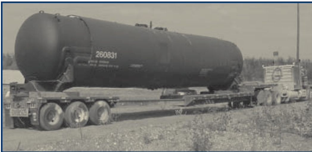
The Alaska Railroad trucks a donated tank car to Fairbanks for "burial."

Donation helps to drop property owner insurance costs