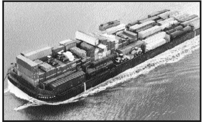
The Railroad's new barge under way.

The gravel business is expected to grow relative to last year and possibly approach the record volumes the Railroad established in 1999. Trailer-on-flat-car (TOFC) sales are also growing, and a 5% increase in volume for the year is expected in that category.