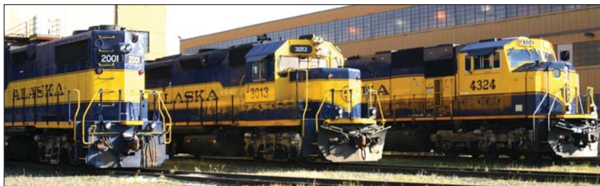
Left-to-right: A GP-38 locomotive (No. 2001), GP-40 locomotive (No. 3013) and a newer SD70MAC locomotive (No. 4324).